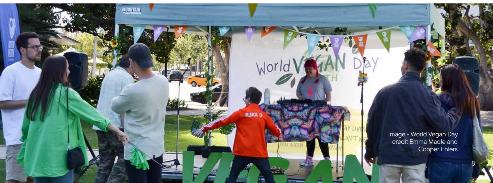
Image - World Vegan Day