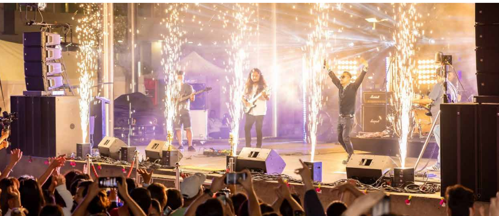
Image - Nepali New Year

You are required to discuss your application with a City Sponsorship and Grants Officer prior to commencing an application to ensure you are applying in the most suitable program.