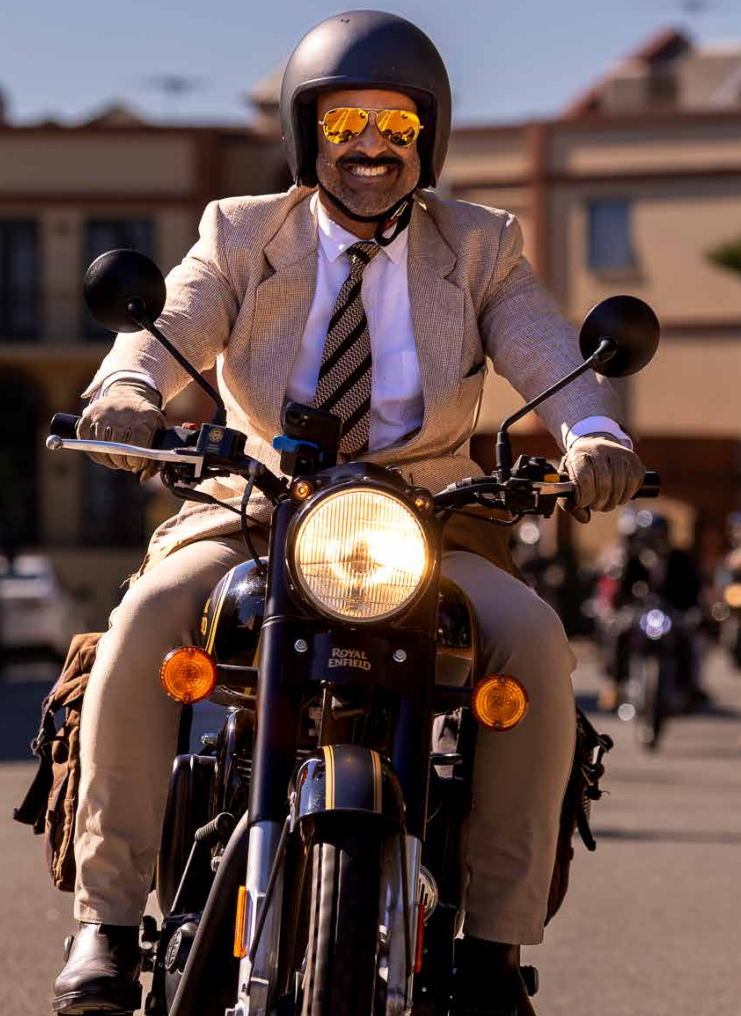
Image - Distinguished Gentlemens Ride

Acquittal reports will be considered as part of future funding applications.