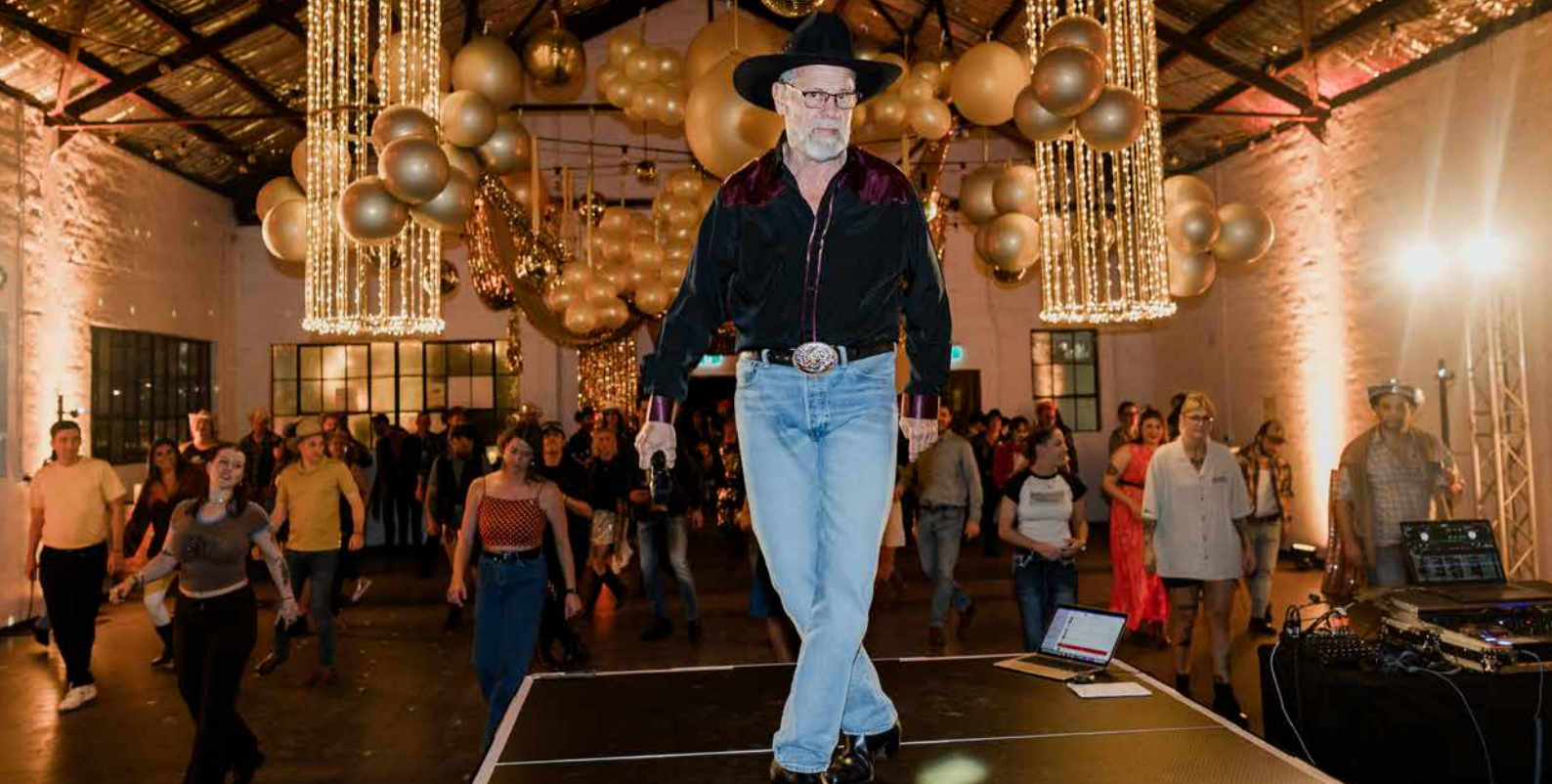
Image - Barn Dance