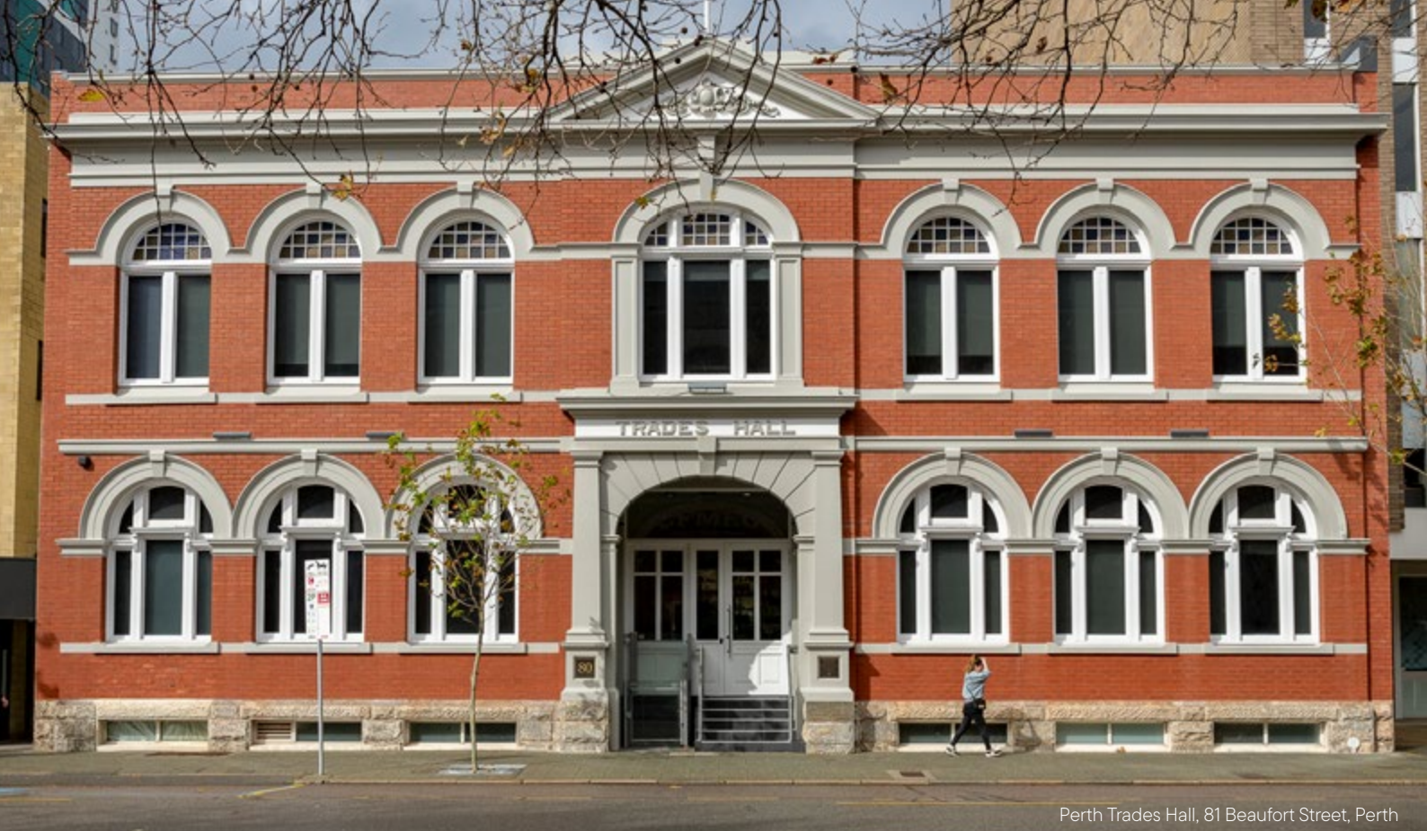
Perth Trades Hall, 81 Beaufort Street, Perth