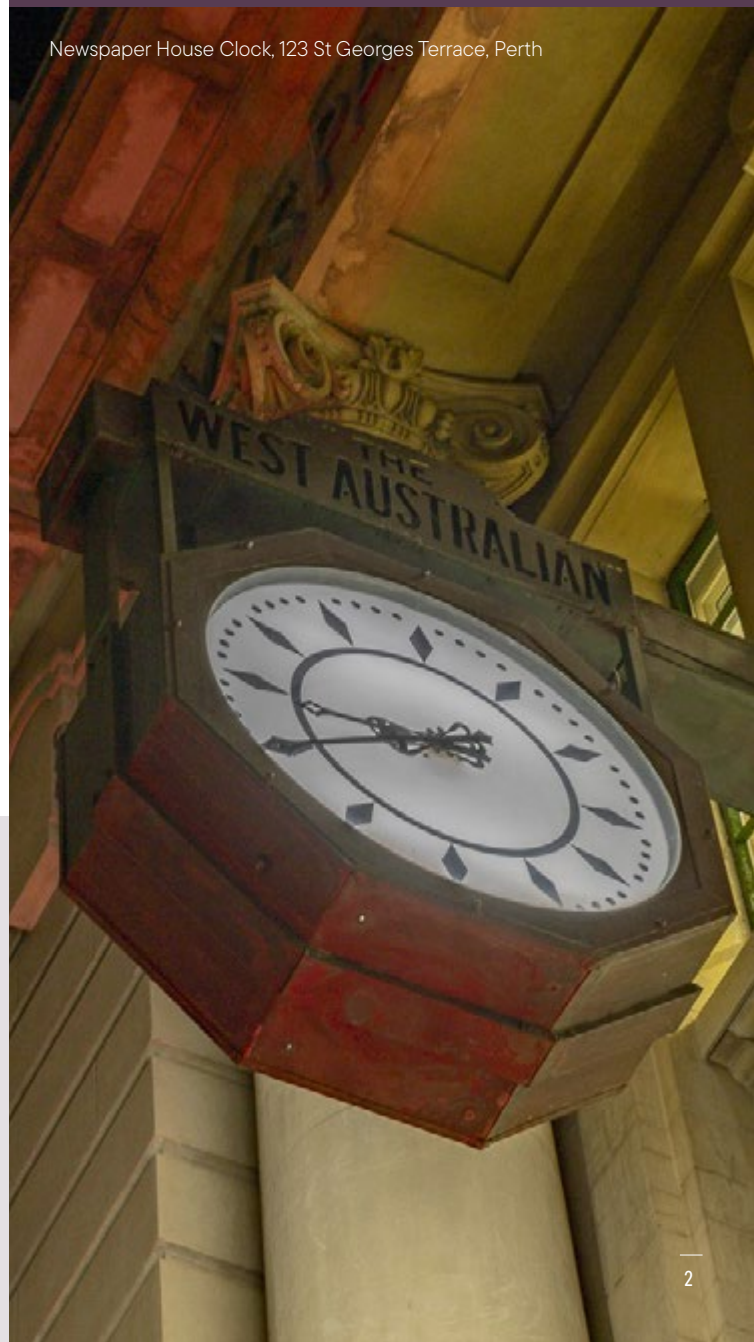
Newspaper House Clock, 123 St Georges Terrace, Perth