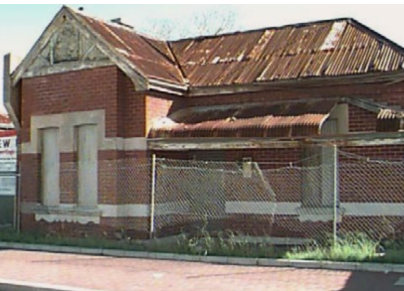
64 Aberdeen Street, Northbridge 1998