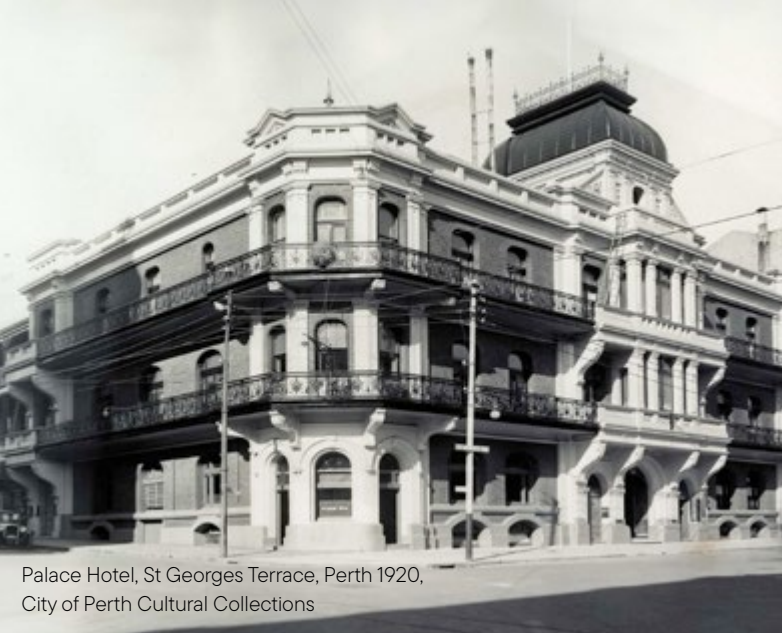
Palace Hotel, St Georges Terrace, Perth 1920