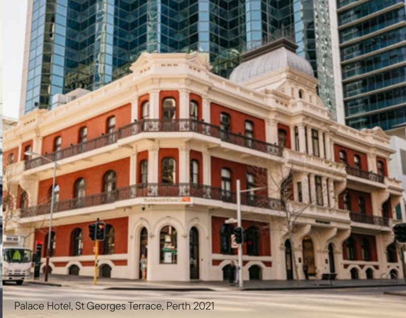
Palace Hotel, St Georges Terrace, Perth 2021