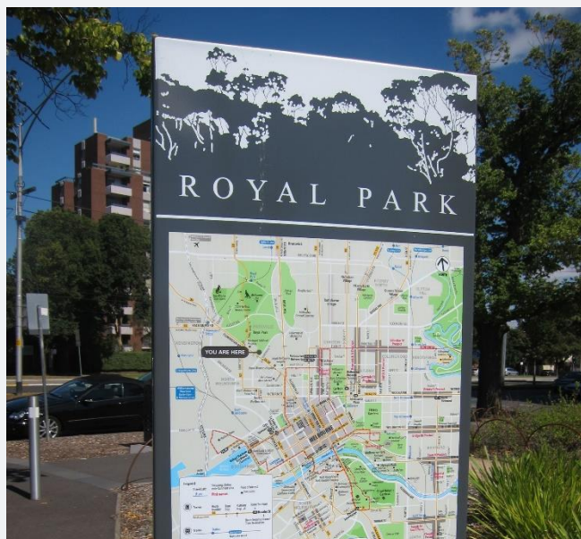
Graphic application on park sign example: Royal Park, Melbourne

Precedent projects The images below are a guide only and in no way representative of the style of work sort through this brief. The City is looking for a unique aesthetic that is congruous with the visual language of the way-finding and park signage.