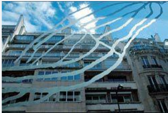
Etched glass example: Musée du quai Branly, Paris