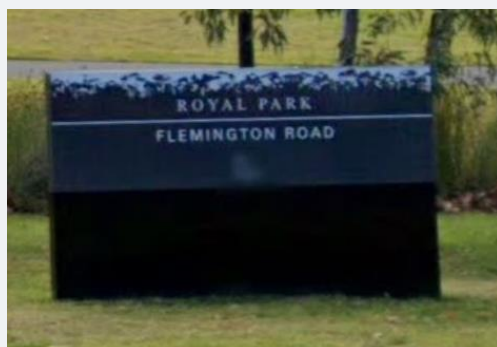
Park sign example: Royal Park, Melbourne