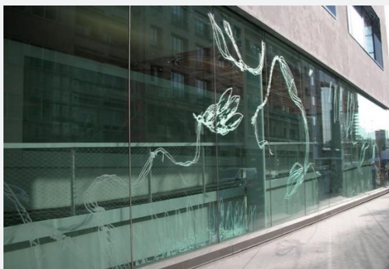
Etched glass example: Musée du quai Branly, Paris

Precedent projects The images below are a guide only and in no way representative of the style of work sort through this brief. The City is looking for a unique aesthetic that is congruous with the visual language of bus shelters.