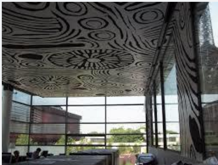
Soffit example: Musée du quai Branly, Paris