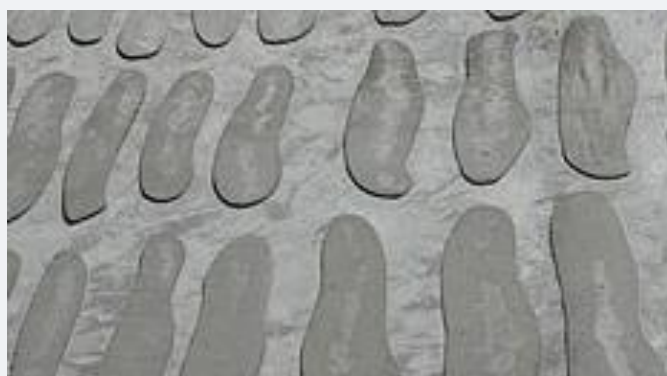
Concrete pattern example: Musée du quai Branly, Paris

Precedent projects The images below are a guide only and in no way representative of the style of work sort through this brief. The City is looking for a unique aesthetic that is congruous with the visual language of the planters.