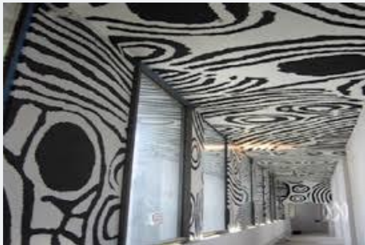
Soffit example: Musée du quai Branly, Paris