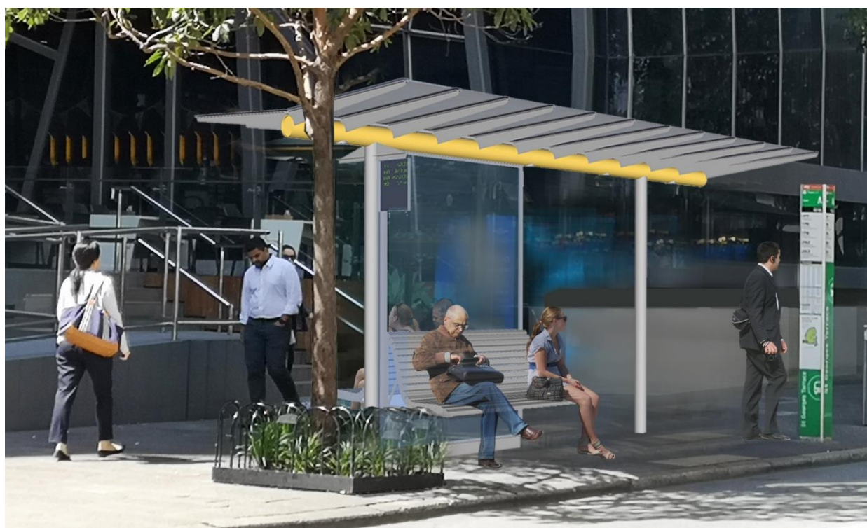
Photomontage - proposed bus shelter

The City is currently developing a prototype bus shelter to inform the replacement of shelters in the future. There is an opportunity to install patterning to the shelter, to create an element of surprise with an application to the soffit and improve the visibility of the glass panels. The intent with the soffit is to illuminate this at night.