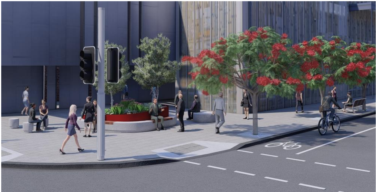
Photomontage - proposed planters – Roe Street

The project will include large planters throughout the street including outside the Heath Ledger Theatre on the corner of William and Roe Streets.