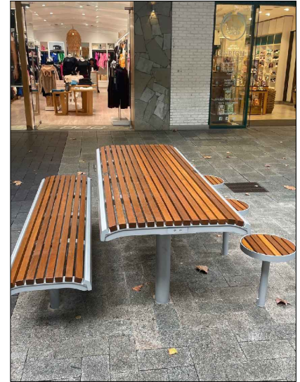
A PICNIC SET - 2M SETOUT PLAN