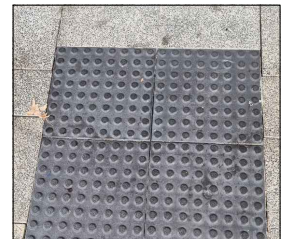
400X400X60 TACTILE PAVER - BLACKURBANSTONE WETCAST PAVER WITH PENETRABLE BREATHABLE SEALANT (DRYCRETE)