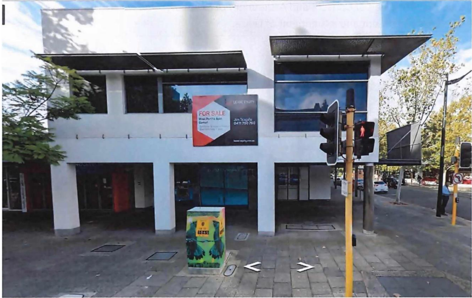
1275 Hay Street – Street View - Colonnade