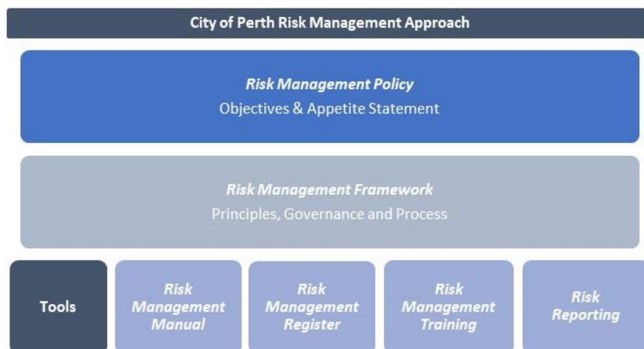
Figure 1: City of Perth Risk Management Approach

The proposed policy identifies the following key focus areas for the organisation, in order to embed enterprise wide risk management: