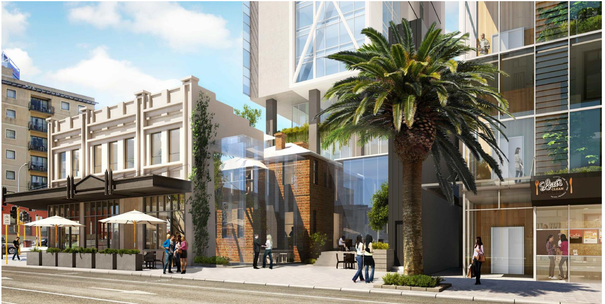
16/5095 - 39-55 MILLIGAN STREET AND 469-471 MURRAY STREET, PERTH