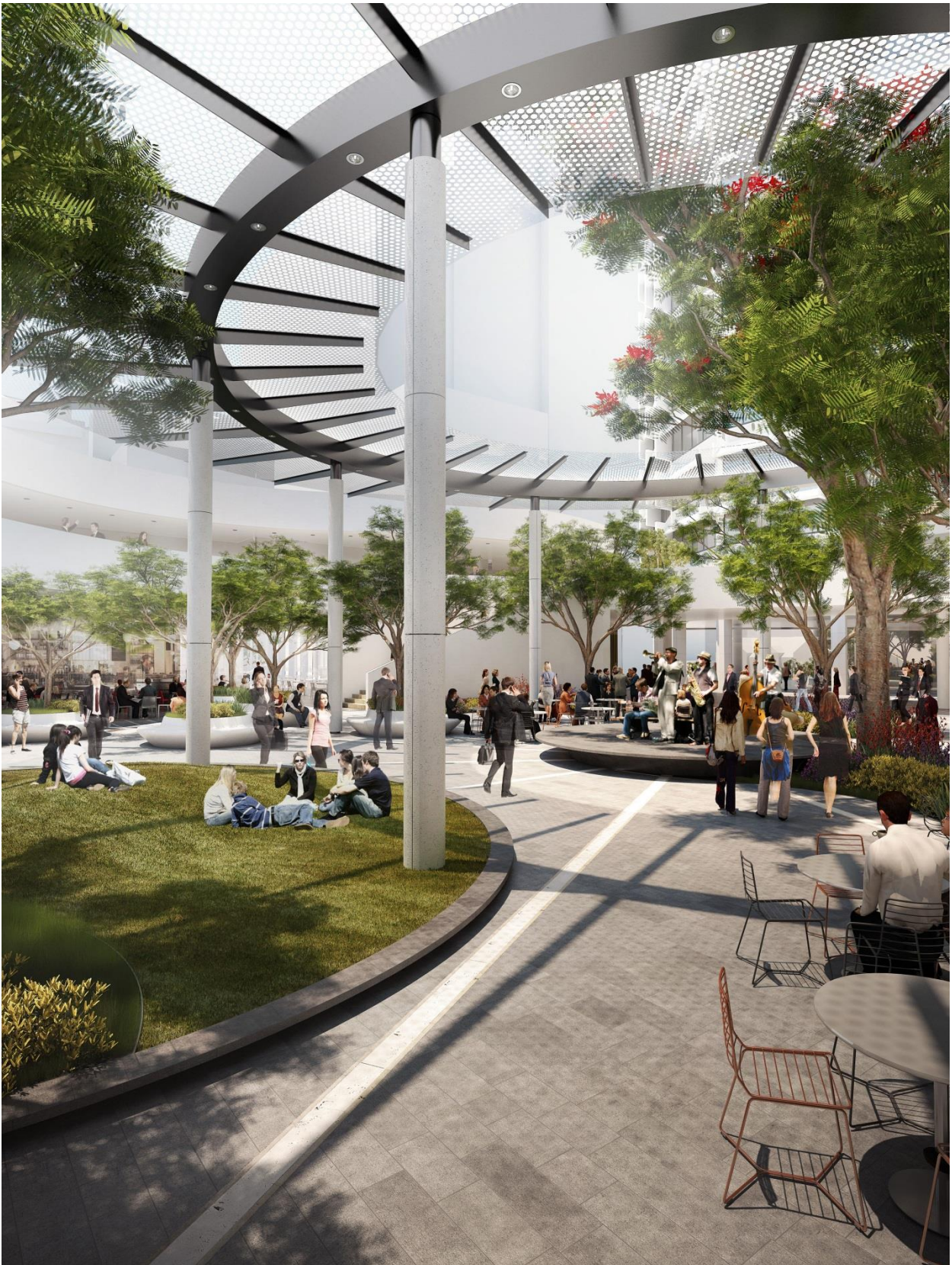
2015/5453 – 250 (LOT 164) ST GEORGES TERRACE, PERTH – PUBLIC PLAZA