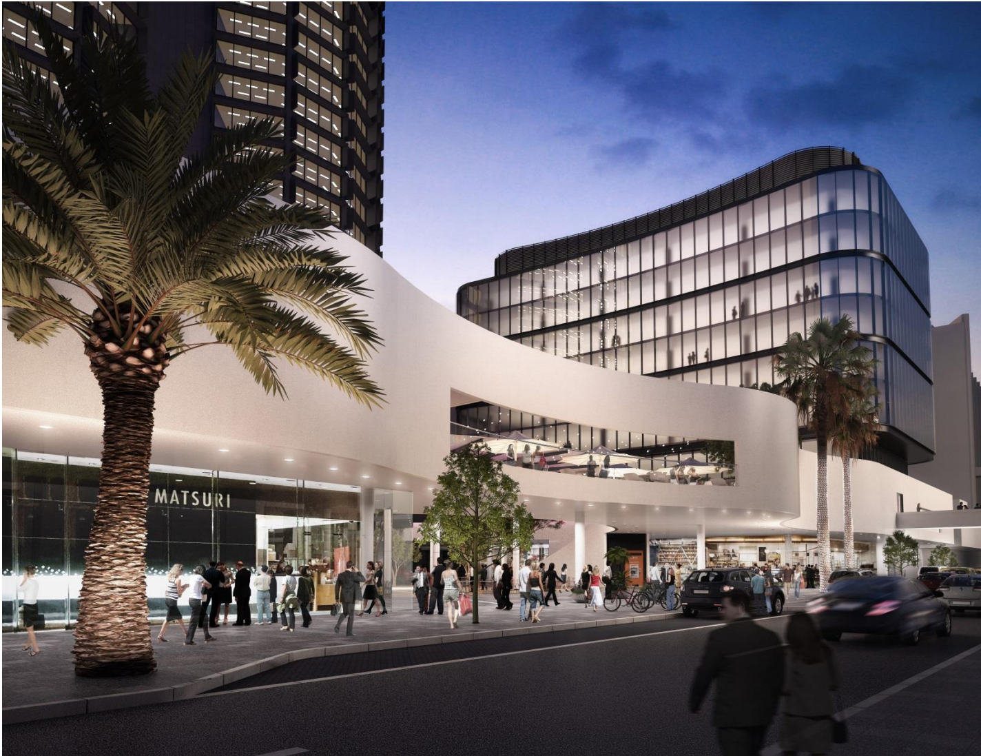
2015/5453 - 250 (LOT 164) ST GEORGES TERRACE, PERTH – QV2