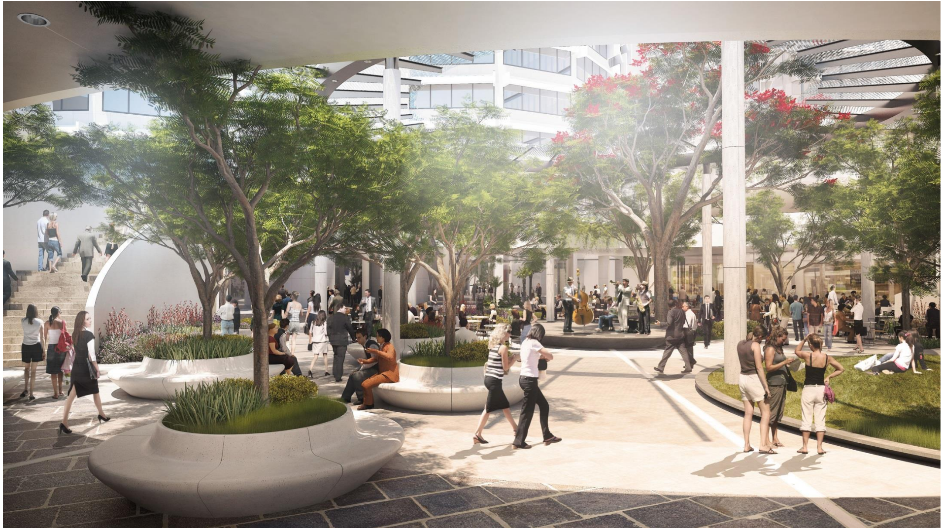
2015/5453 – 250 (LOT 164) ST GEORGES TERRACE, PERTH – PUBLIC PLAZA