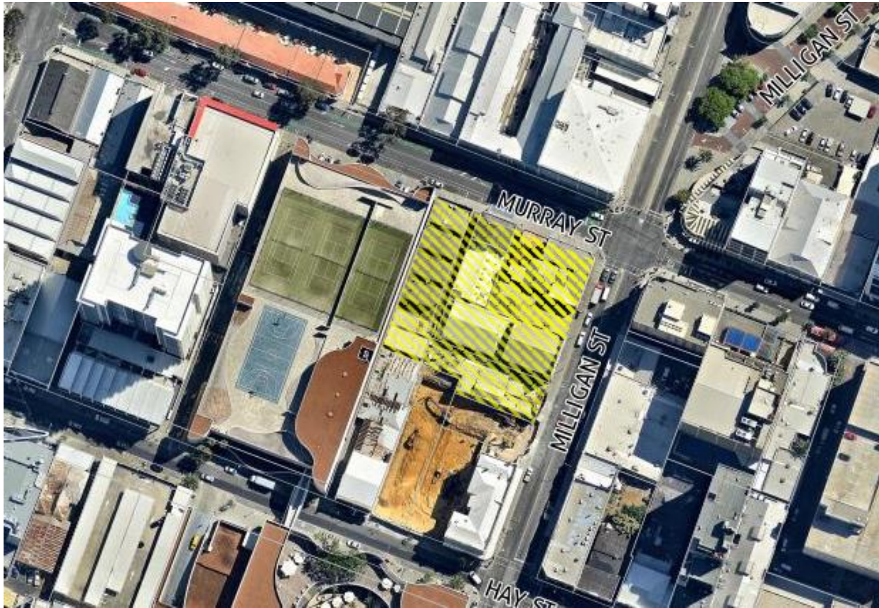
16/5095; 39-55 MILLIGAN STREET AND 469-471 MURRAY STREET, PERTH