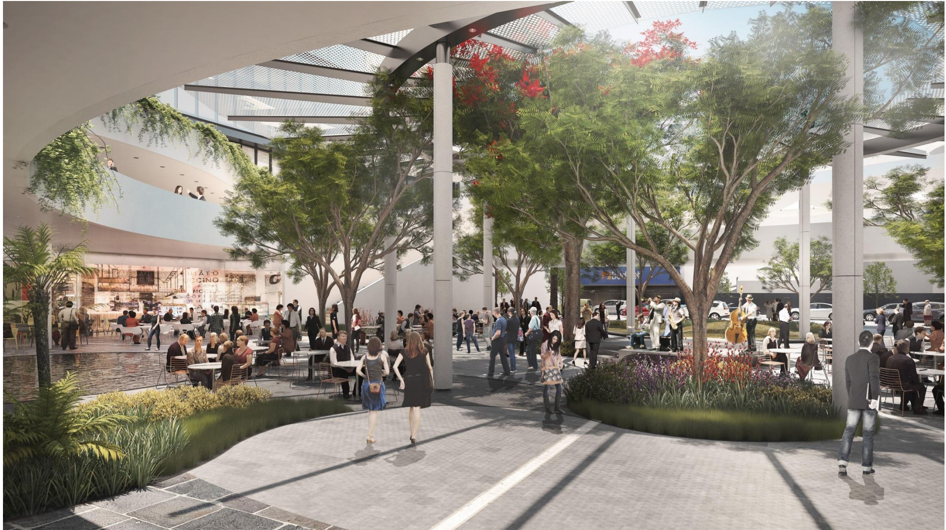
2015/5453 – 250 (LOT 164) ST GEORGES TERRACE, PERTH – PUBLIC PLAZA