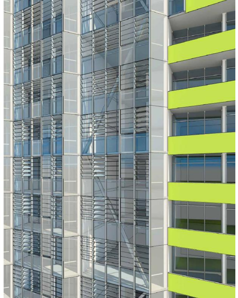
16/5095 - 39-55 MILLIGAN STREET AND 469-471 MURRAY STREET, PERTH