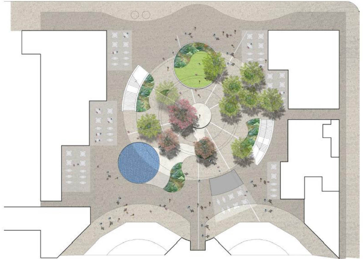
2015/5453 – 250 (LOT 164) ST GEORGES TERRACE, PERTH – PUBLIC PLAZA