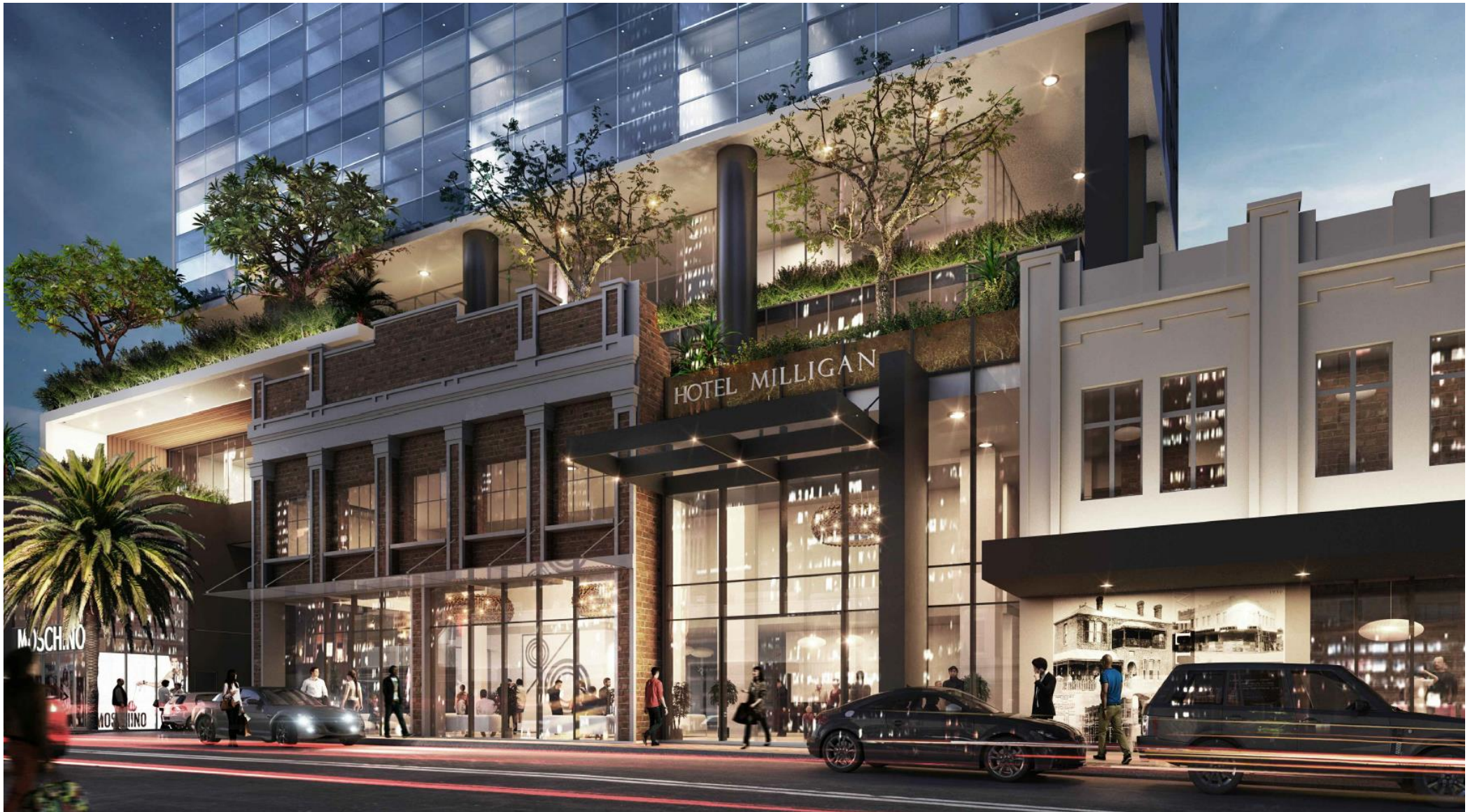
16/5095 - 39-55 MILLIGAN STREET AND 469-471 MURRAY STREET, PERTH