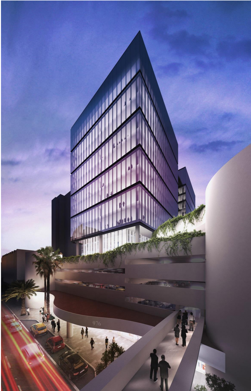
2015/5453 – 250 (LOT 164) ST GEORGES TERRACE, PERTH – QV3