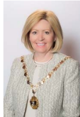
The Right Honourable The Lord Mayor Ms Lisa-M. Scaffidi