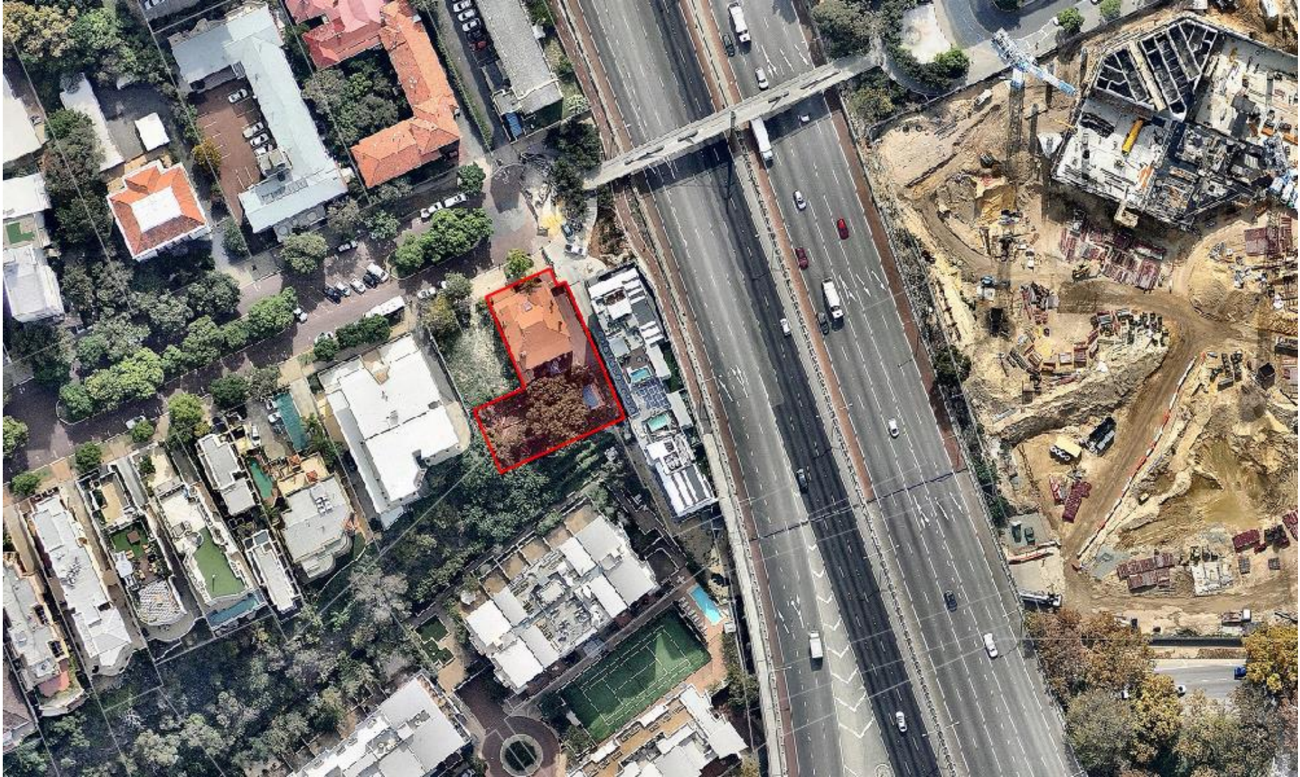
2015/5218: 37A-37C MOUNT STREET, WEST PERTH