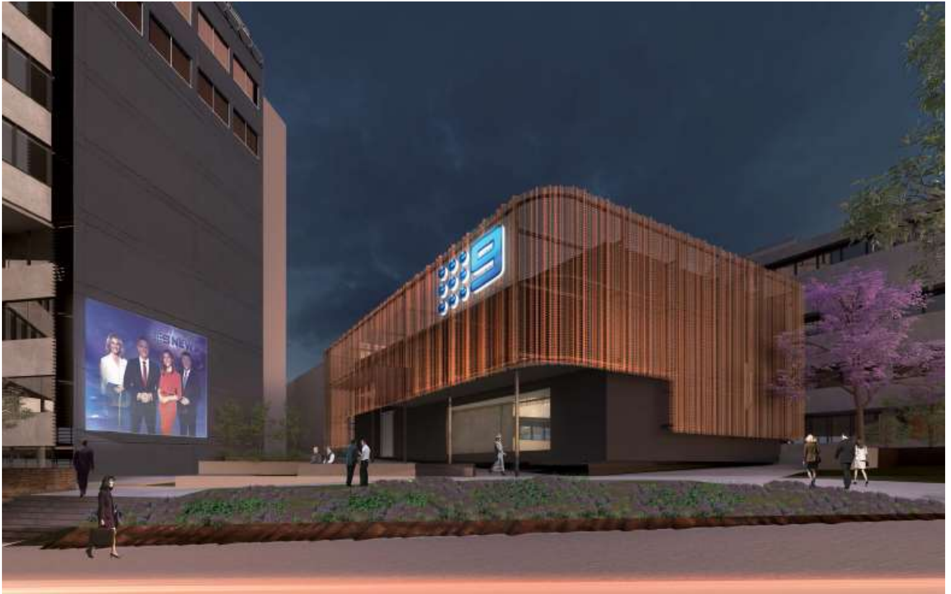
2015/5292: 251-267 (LOTS 10, 11 AND 412) ST GEORGES TERRACE, PERTH