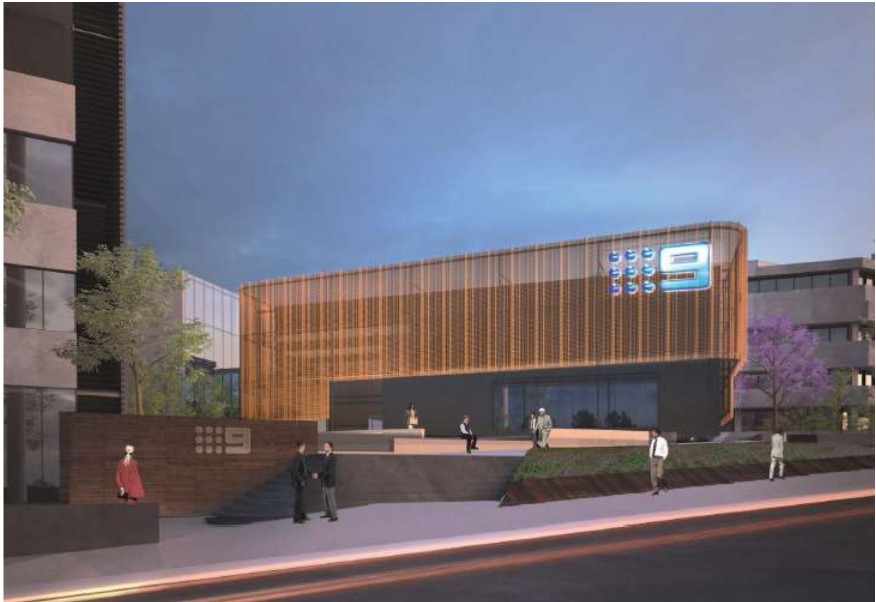
2015/5292: 251-267 (LOTS 10, 11 AND 412) ST GEORGES TERRACE, PERTH