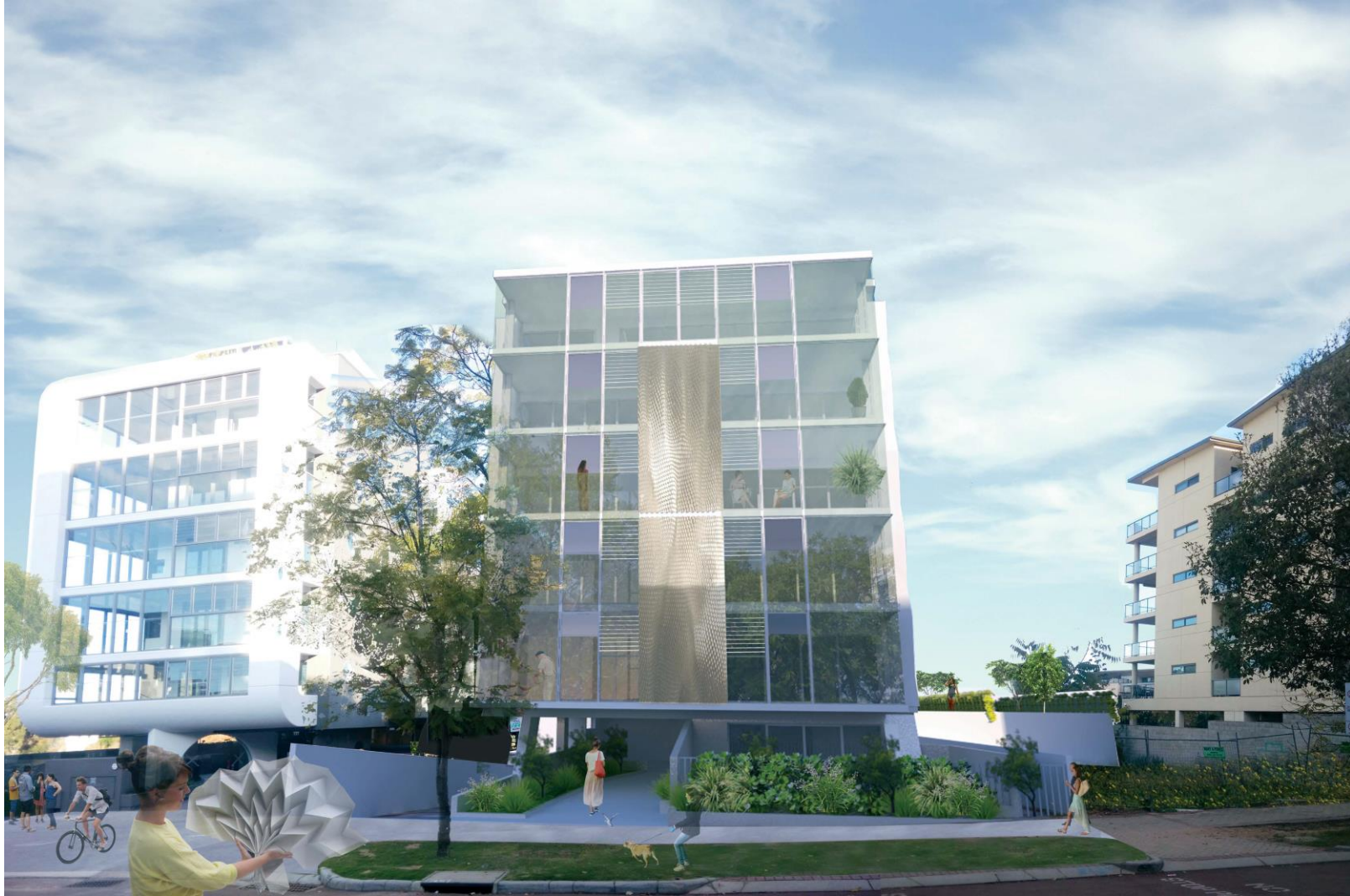
15/5218 - 37A-37C MOUNT STREET, WEST PERTH (PERSPECTIVE 2)