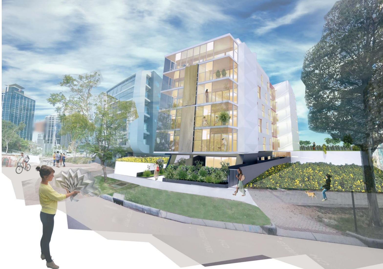
15/5218 - 37A-37C MOUNT STREET, WEST PERTH (PERSPECTIVE 1)