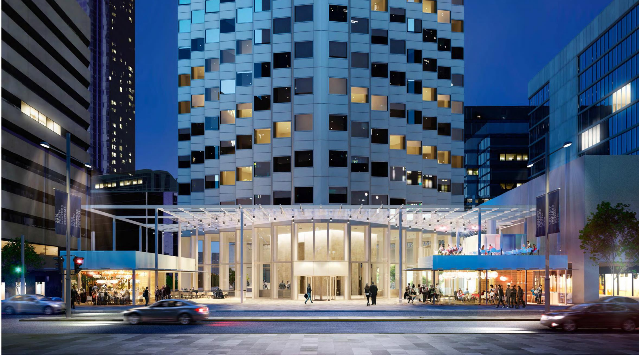
14/5555; 77 (LOT 50) ST GEORGES TERRACE, PERTH (PERSPECTIVE 5)