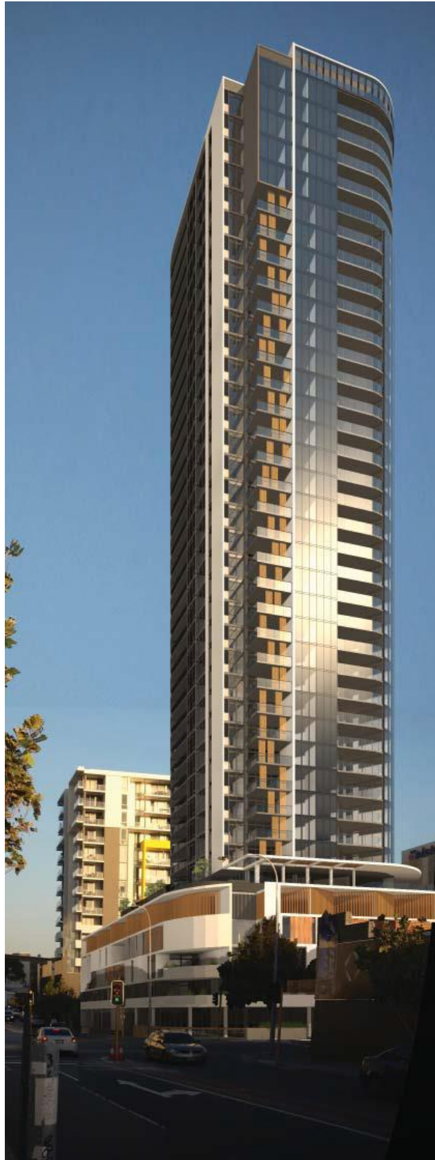
2015/5142; 108 (LOT 501) STIRLING STREET, PERTH