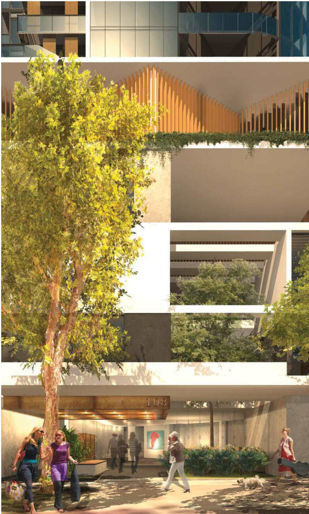
2015/5142; 108 (LOT 501) STIRLING STREET, PERTH