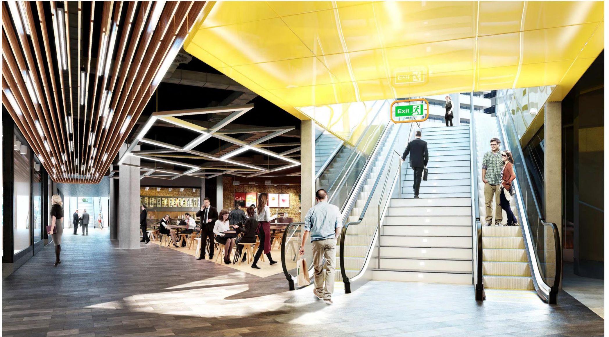
14/5555; 77 (LOT 50) ST GEORGES TERRACE, PERTH (PERSPECTIVE 4)