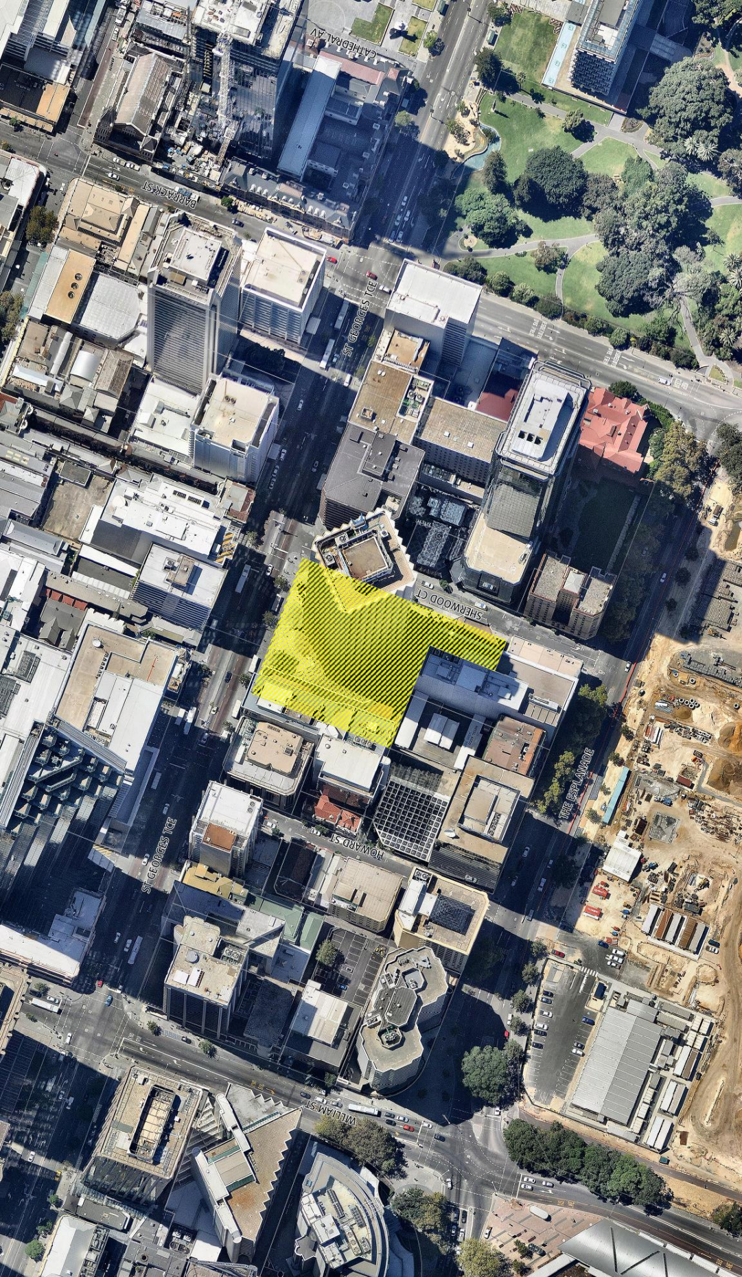
14/5555; 77 (LOT 50) ST GEORGES TERRACE, PERTH