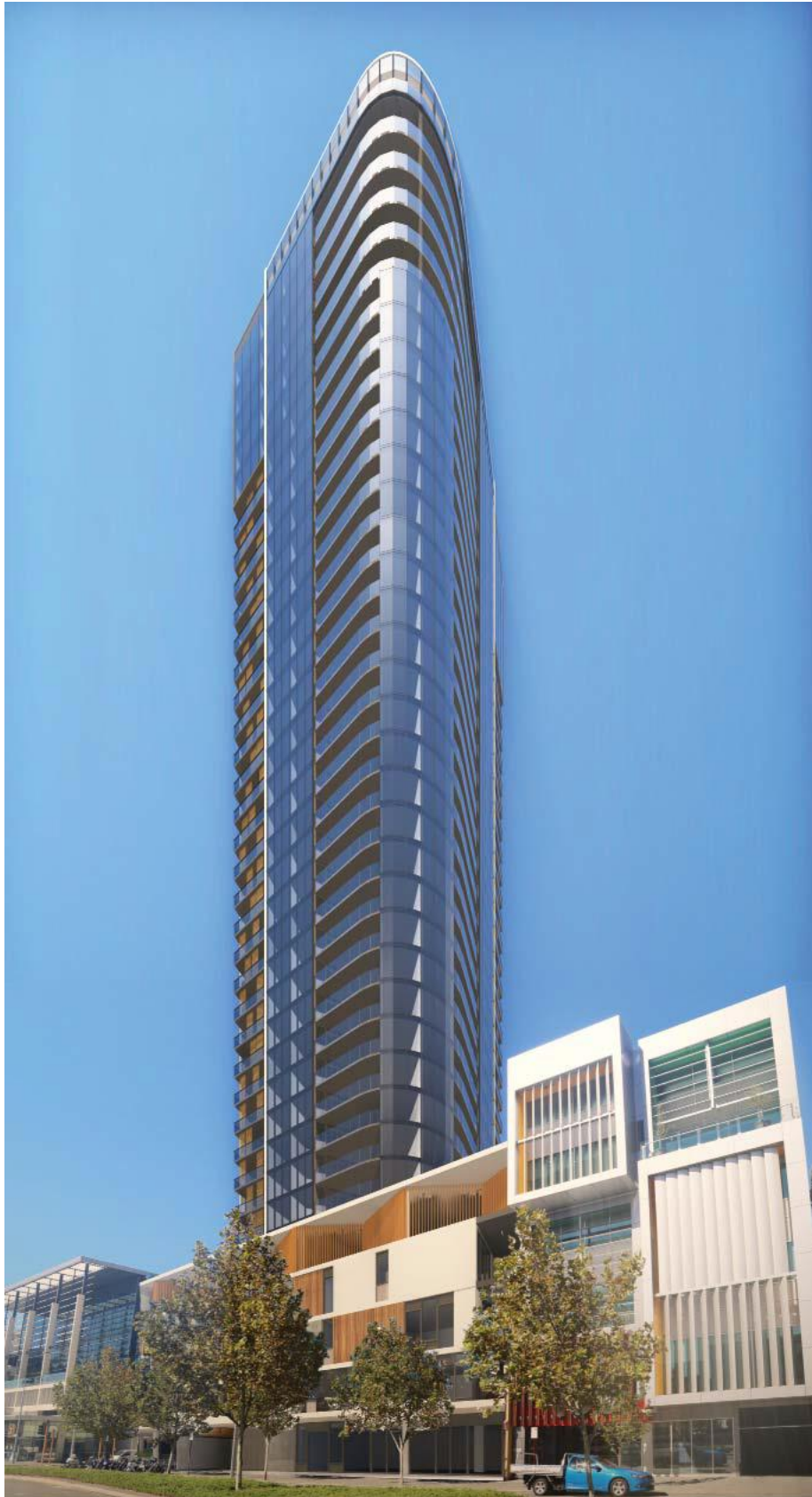
2015/5142; 108 (LOT 501) STIRLING STREET, PERTH