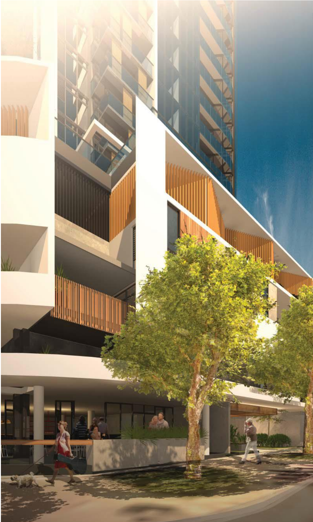
2015/5142; 108 (LOT 501) STIRLING STREET, PERTH