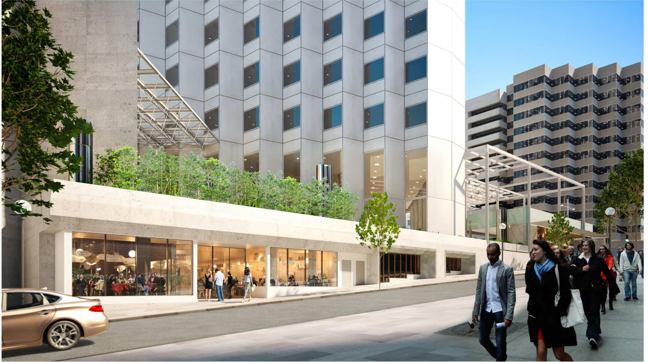
14/5555; 77 (LOT 50) ST GEORGES TERRACE, PERTH (PERSPECTIVE 3)