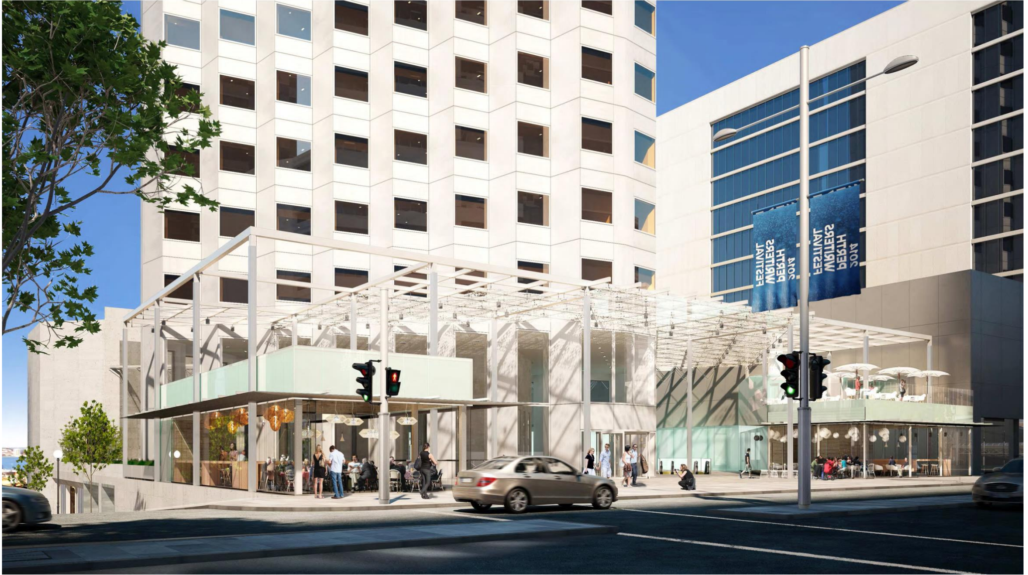
14/5555; 77 (LOT 50) ST GEORGES TERRACE, PERTH (PERSPECTIVE 2)