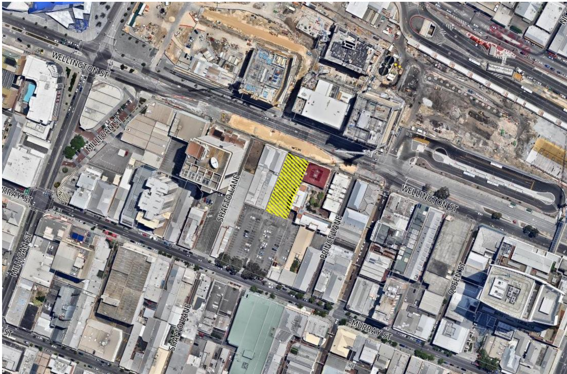
14/5559; 609 WELLINGTON STREET, PERTH