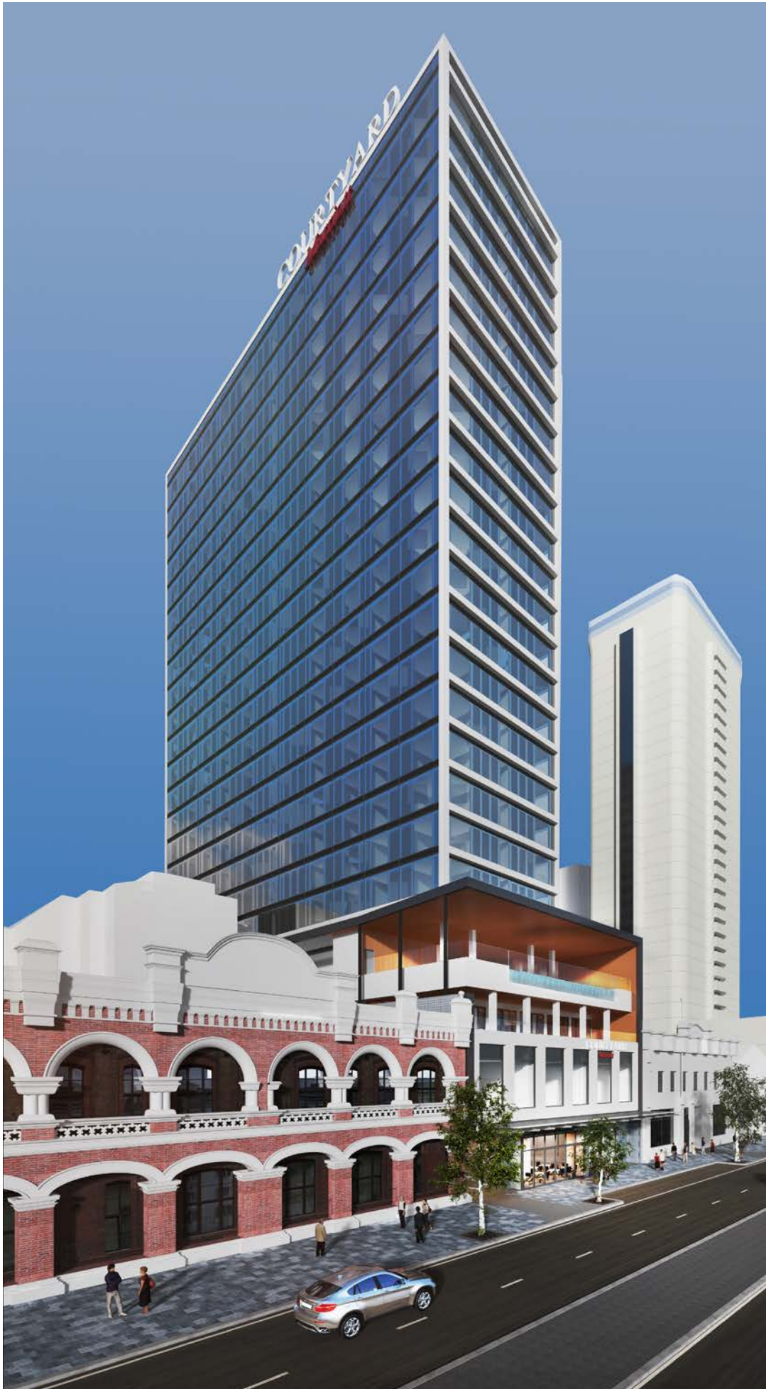
14/5559; 609 WELLINGTON STREET, PERTH (PERSPECTIVE 1)