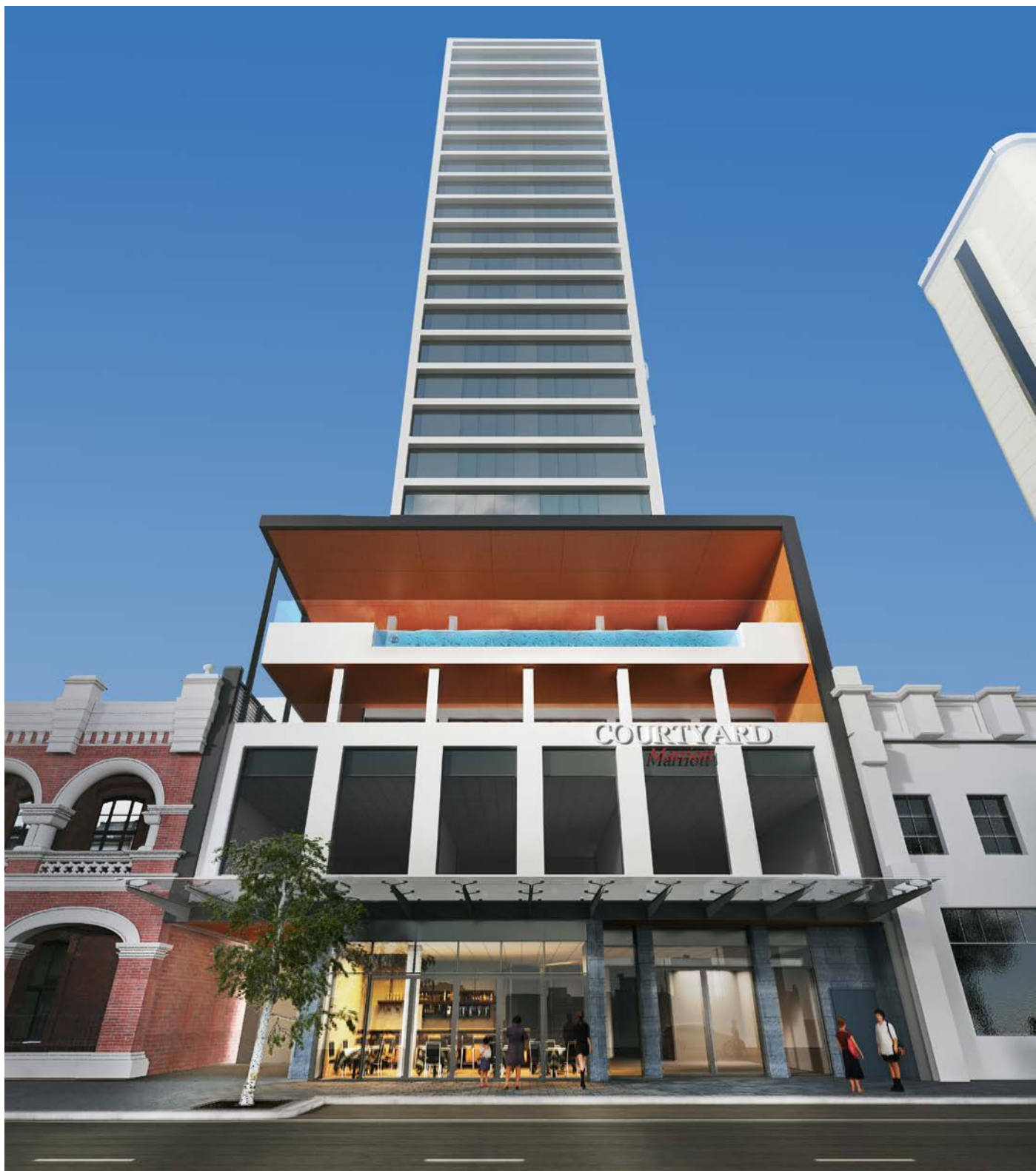
14/5559; 609 WELLINGTON STREET, PERTH (PERSPECTIVE 2)