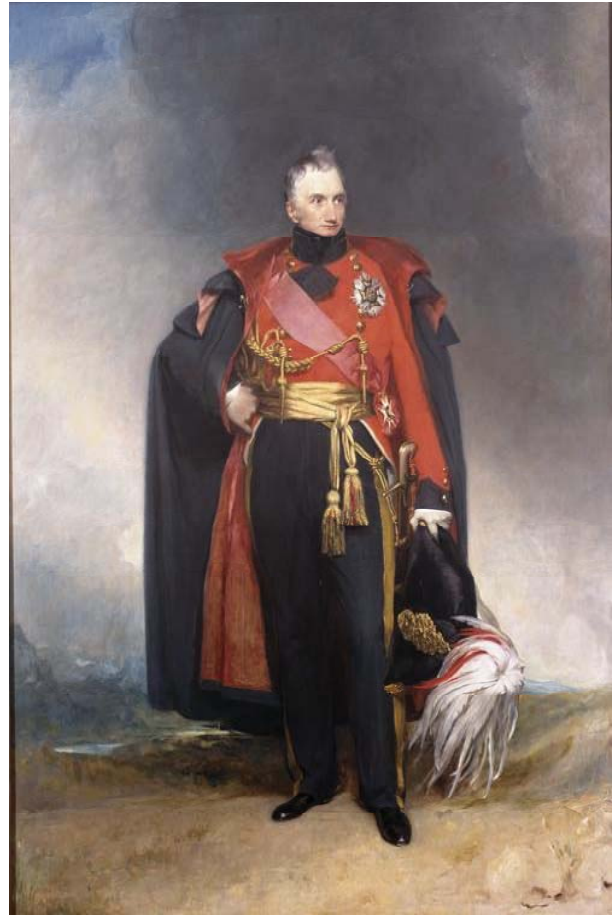
Portrait of General, Rt Hon. Sir George Murray GC. BPC, Lord Provost of Scotland 1772-1846, Colonial Secretary 1828-30