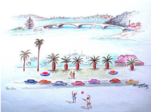
The New Narrows Bridge, 1959 watercolour, pen and ink on paper by Elizabeth Durack