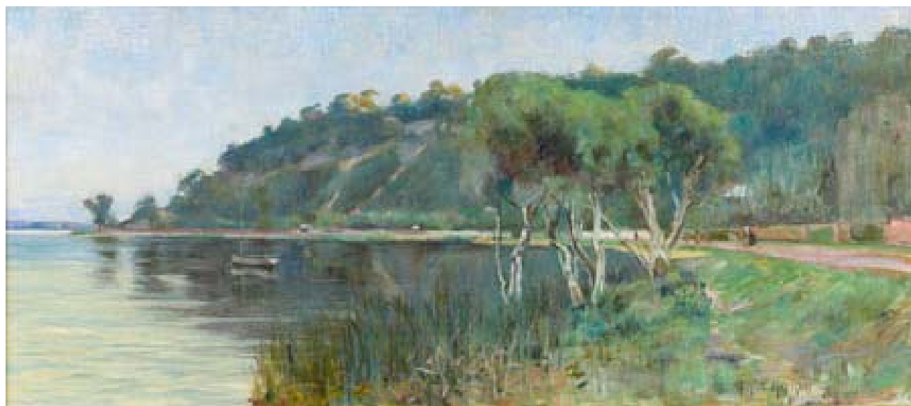
(below) Swan River Foreshore, 1901 oil on canvas by George Pitt-Morison