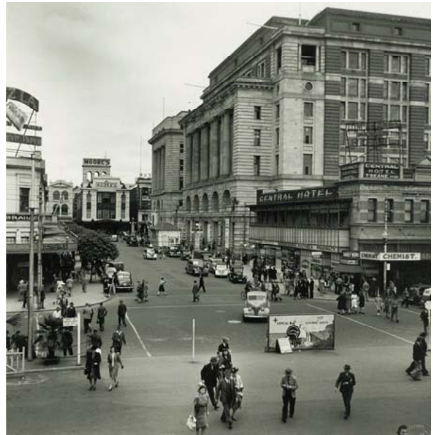
Untitled (View of Forrest Place), 1946 by Max Dupain Photograph