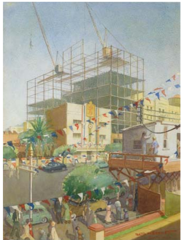
(above) For the Queen's Visit, 1954 By Portia Bennett Watercolour on paper