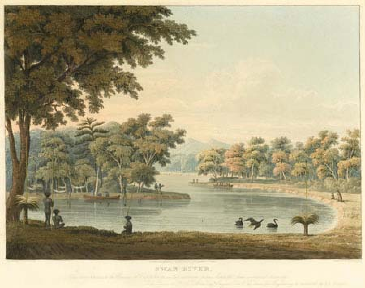
Swan River (Bivouac of Captain Stirling, View of the Swan River 50 Miles Up), hand coloured aquatint etching

HUGGINS (after) Engraved by E.Duncan (London Publishing by JW Huggins) 1828-9 circa