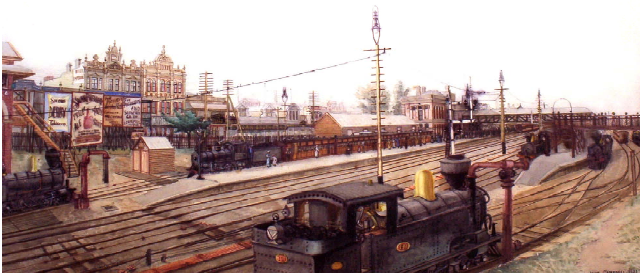
(above) Perth Railway Station, 1903 Watercolour by John Campbell